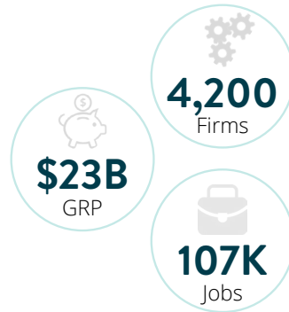
Manufacturing Employment Breakdown 4

From food and beverage manufacturing, to furniture, high-tech devices in biotechnology and aerospace, the San Diego region is home to a very broad manufacturing industry. The region's 107K manufacturing workers are spread across more than 300 unique industries , with nearly a quarter concentrated in computer and electronic product manufacturing.