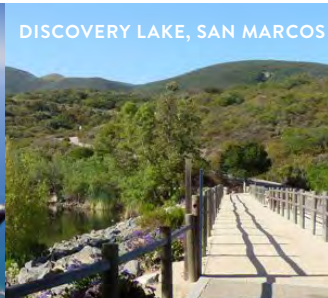
DISCOVERY LAKE, SAN MARCOS