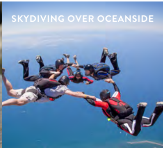
SKYDIVING OVER OCEANSIDE