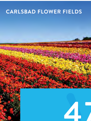
CARLSBAD FLOWER FIELDS

The 78 Corridor's opportunities for success aren't the only thing we've got to boast – the quality of life in the Corridor makes working here easy. From beautiful beaches and weather year-round to great schools and neighborhoods, the 78 is a place to live where you work, and enjoy it.