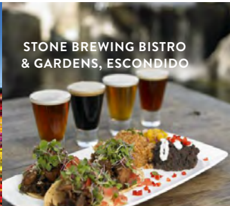
STONE BREWING BISTRO & GARDENS, ESCONDIDO